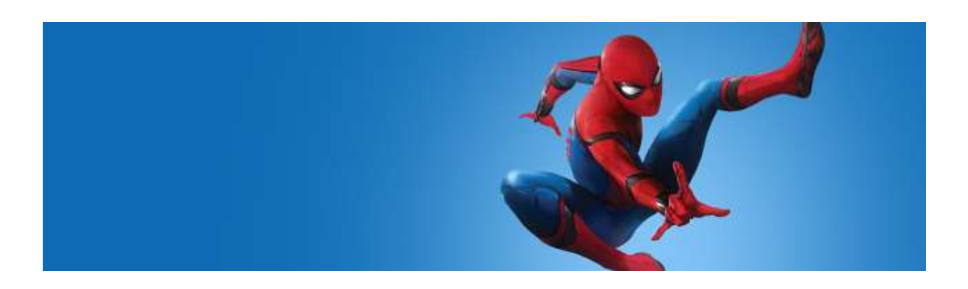
Try to entangle others in your web?